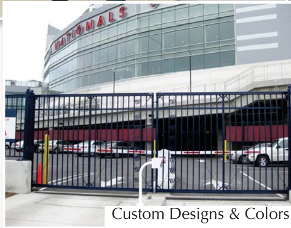
Custom Designs & Colors